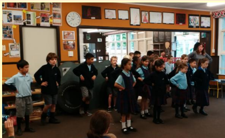
R5 performing Kapa Haka at Northland Kindy this morning